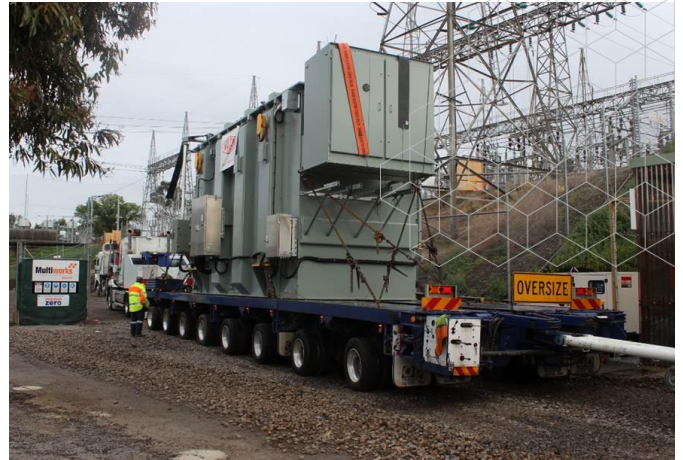
An oversize transformer delivery

We will deliver a reminder notice to Glenlyon Road residences in advance of each transformer delivery and thank the community for their cooperation.