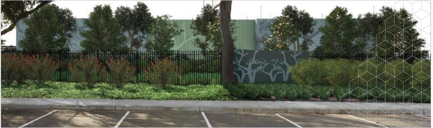
Artist impression of the upgraded Brunswick Terminal Station