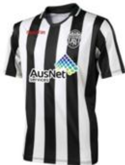
The new Brunswick Zebra's senior jersey

I am also very pleased to announce that AusNet Services is now a proud sponsor of the Brunswick Zebras Football Club, based next door in Sumner Park. The Brunswick Zebras is a fantastic community institution that is highly valued by many in the local area for encouraging outdoor activity for all ages.