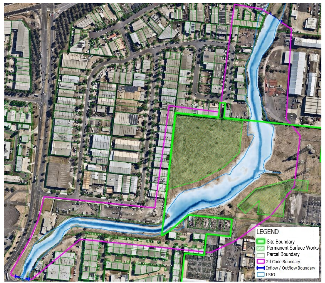
Figure 6 – 1% AEP flood depths shown against LSIO extent