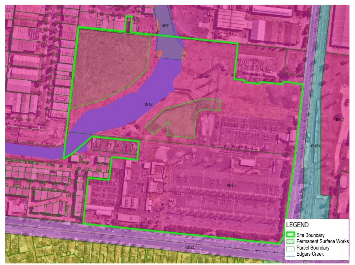
Figure 2 – Site Location and overlays

The requirements of the Urban Floodway Zone (UFZ) and the Land Subject to Inundation Overlay (LSIO) are addressed below: