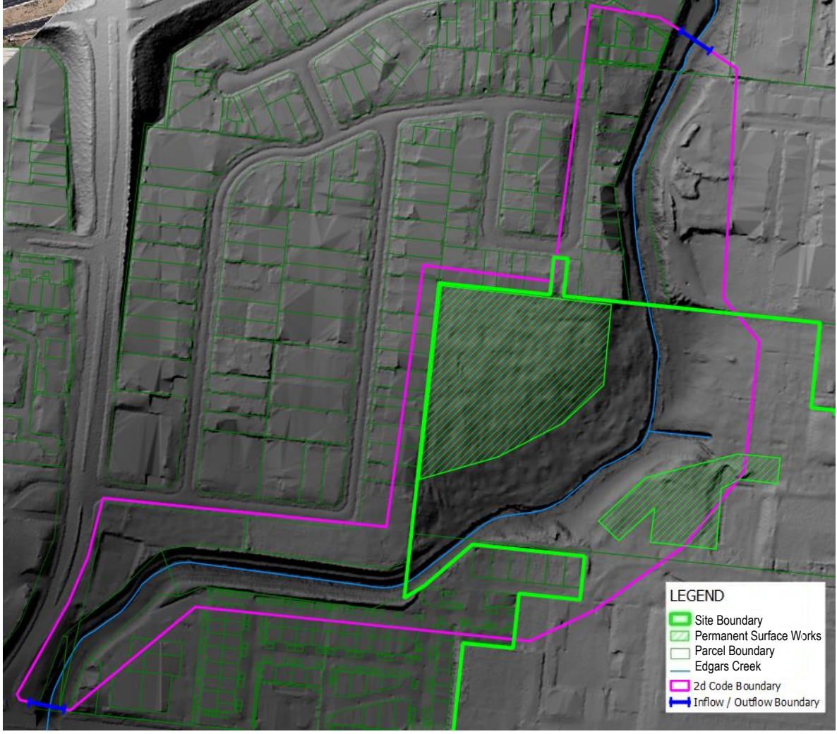
Figure 3 – Surface representation

A digital elevation model (DEM) of the terrain surrounding Edgars Creek was obtained for the project using DELWP LiDAR information and has been used as the basis for the hydraulic model. The DEM at the site location is illustrated in Figure 3.