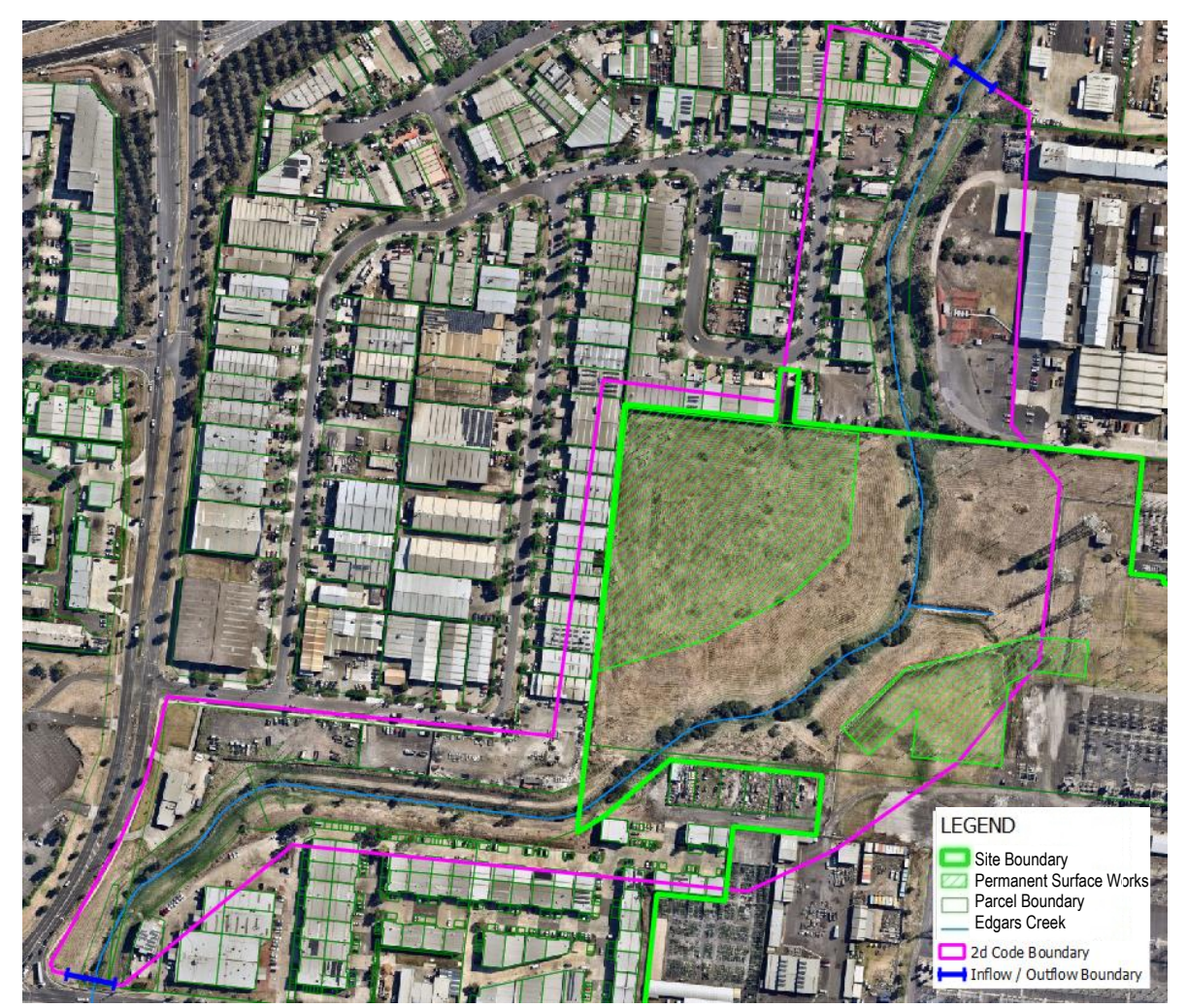
Figure 4 - Boundary conditions and model domain

Surface roughness characteristics have been selected based on Planning Scheme Zoning and validated against aerial imagery. Where discrepancy was found, roughness based on aerial imagery was adopted. The final Manning's n values have been adopted for the modelling and are shown spatially in Figure 5. While further refinement of the roughness values could be conducted, the delineation of areas is considered appropriate for this investigation given the flood flow behaviour.