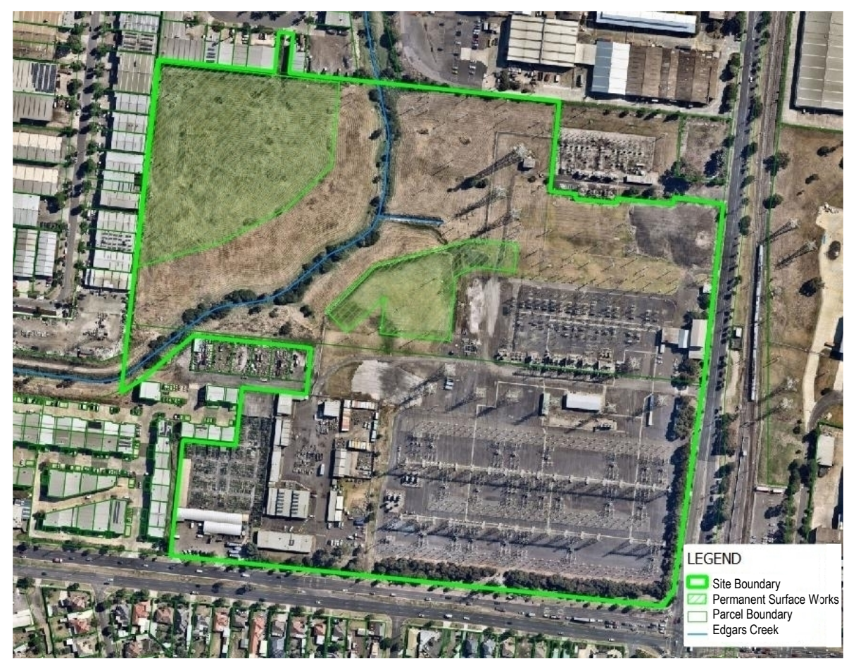
Figure 1 – Site location and proposed works area

The Thomastown Terminal Station (TTS) site is located 14 kilometres north-north-east of the Melbourne CBD, situated between the Metropolitan Ring Road to the north and Mahoneys Road to the south. High Street forms the site's eastern-most boundary, with the site being traversed by the Melbourne Water waterway Edgars Creek (Dr4420).