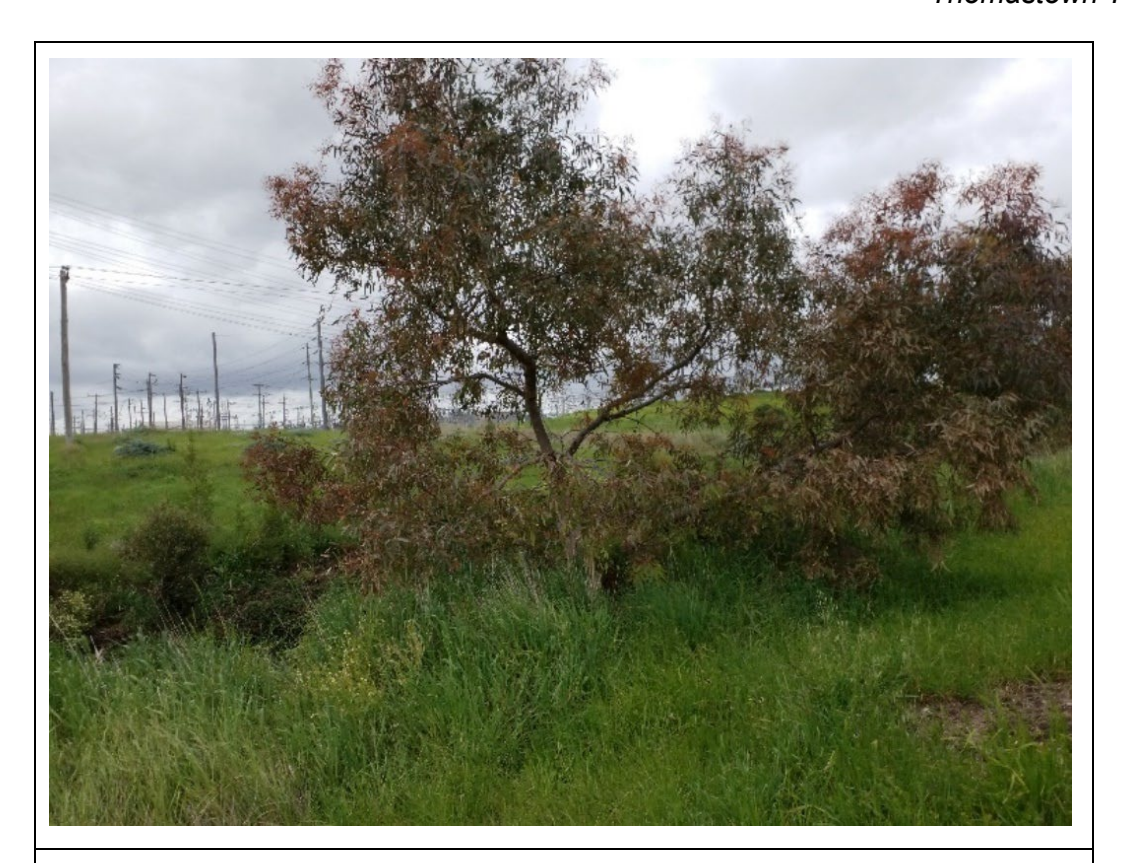
Figure 4-1. EVC 68 Creekline Grassy Woodland