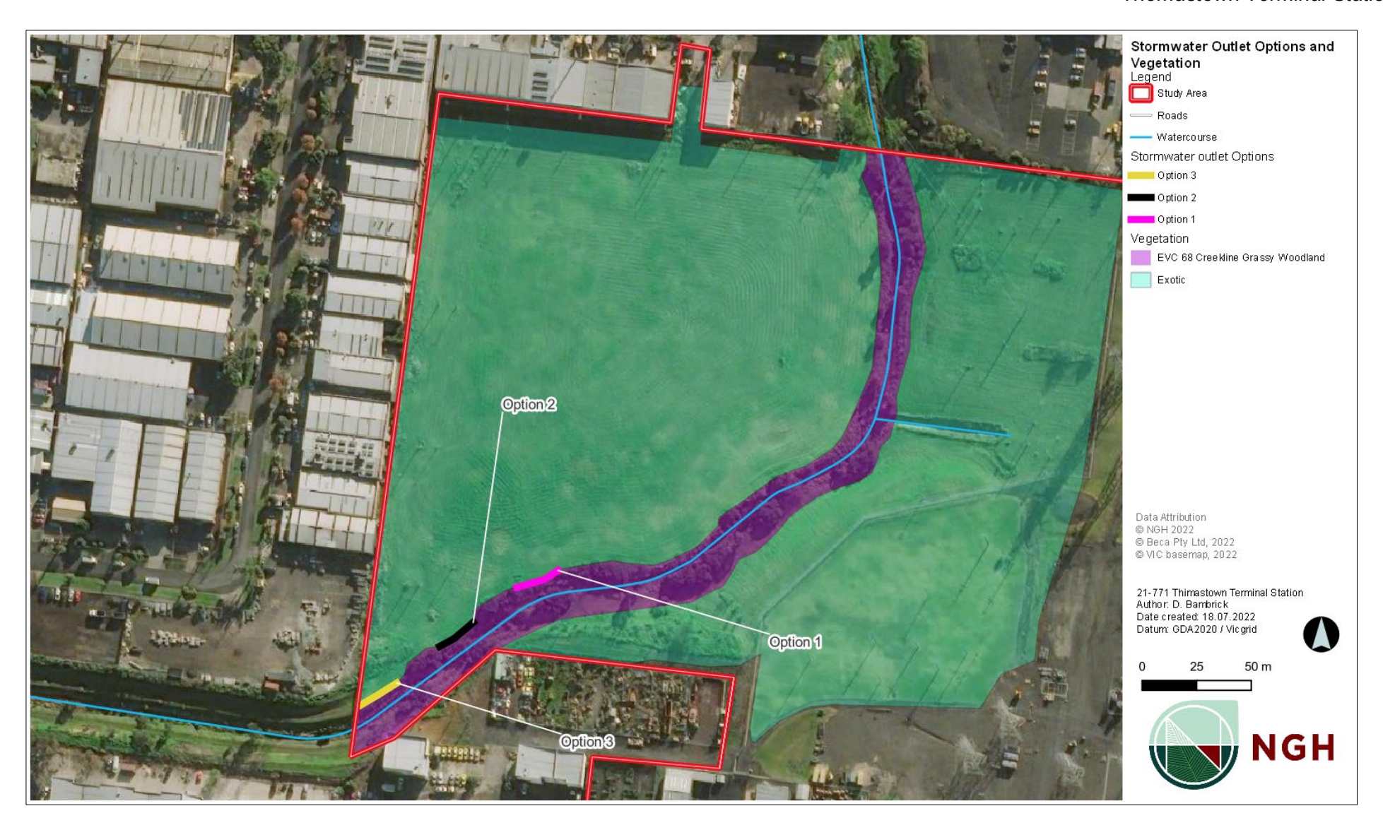
Figure 4-11. Stormwater outlet options