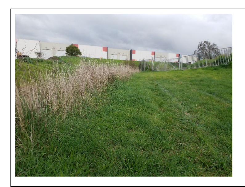
Figure 4-10. Option 3 near the parcel boundary