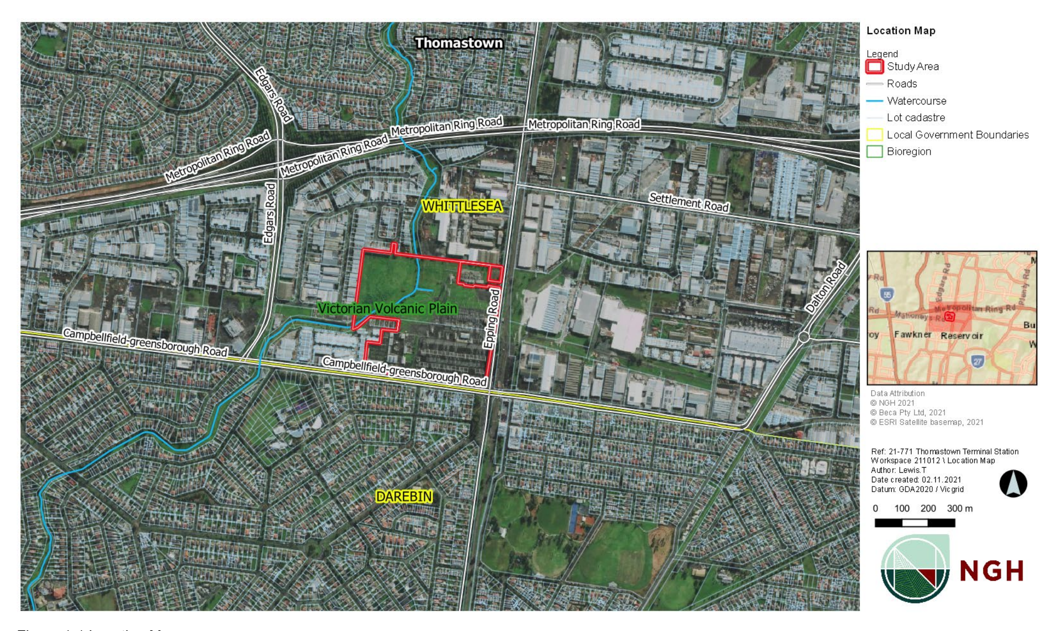
Figure 1-1 Location Map