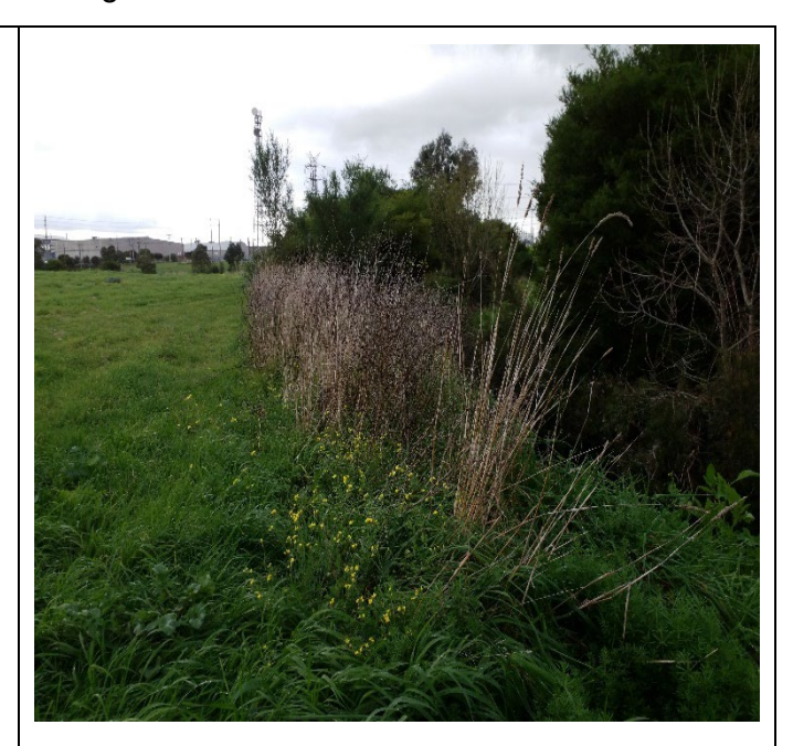
Figure 4-8. Option 1 for the stormwater outlet