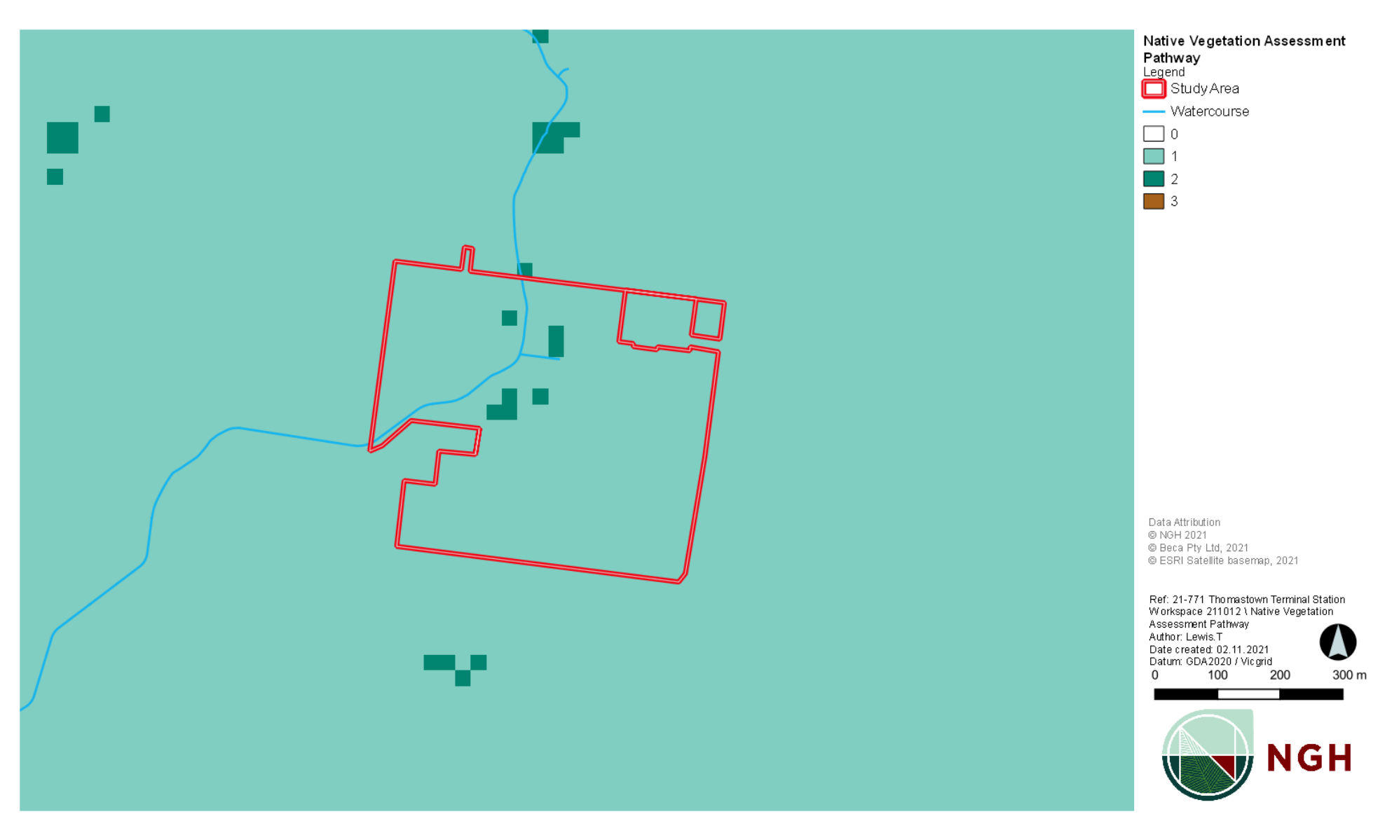
Figure 2-1 Native vegetation assessment pathway.