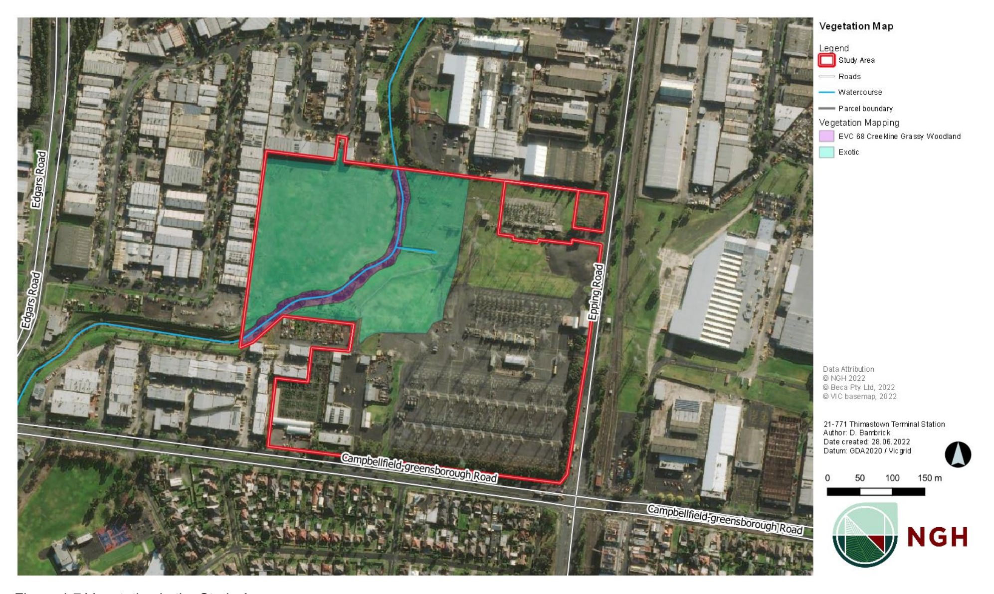
Figure 4-7 Vegetation in the Study Area