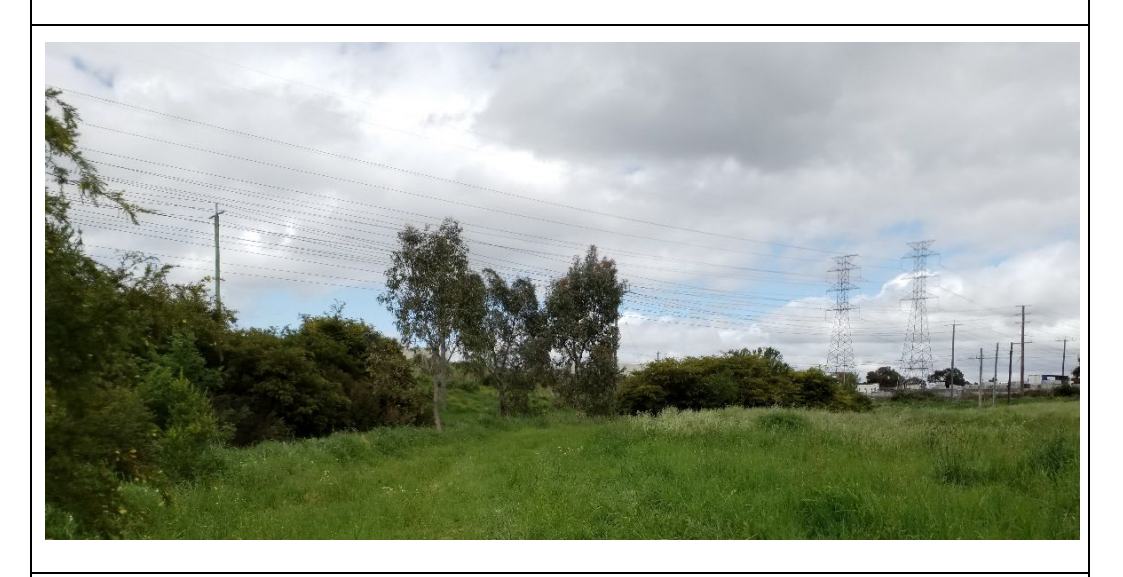
Figure 4-2. EVC 68 Creekline Grassy Woodland